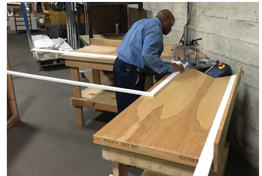
Produce 3 casing hoops per minute

DRAW FROM UP TO 5 VNAIL SIZES; DRIVE & STACK VNAILS IN UP TO 10 POSITIONS.