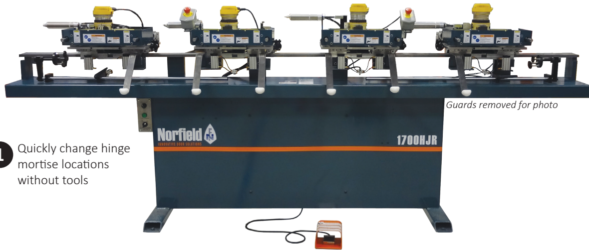
Guards removed for photo